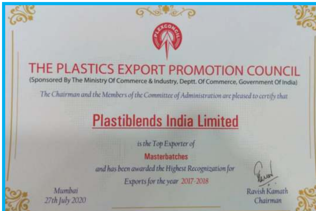
PLEXCONCIL Top Exporter of Masterbatch award for the Year 2017-18.